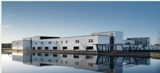
Urban Village Medical Practice

We would also welcome feedback from patients, as this is important to see if we can do things better.